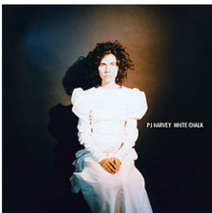
Figure 7 White Chalk Album Cover