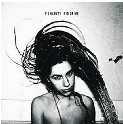
Figure 2 Rid of Me Album Cover