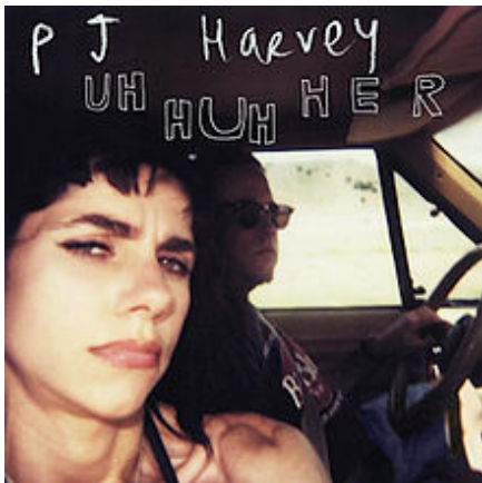
Figure 6 Uh Huh Her Album Cover

2004 released studio album “Uh Huh Her” cover has only neutrals as colors contrasting with black areas. Positive and negative areas divides surface into areas. Viewer failed to understand which is front which is back. Size contrasts, tonal contrasts and the free style typography makes the cover as dynamic as it can be. The handwriting and hand drawing letters are floating on a dark space and differentiates the musician and the name of the album.