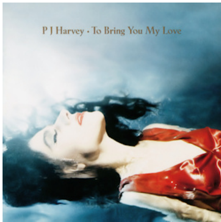
Figure 3 To Bring You My Love Album Cover