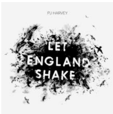
Figure 8 Let England Shake Album Cover